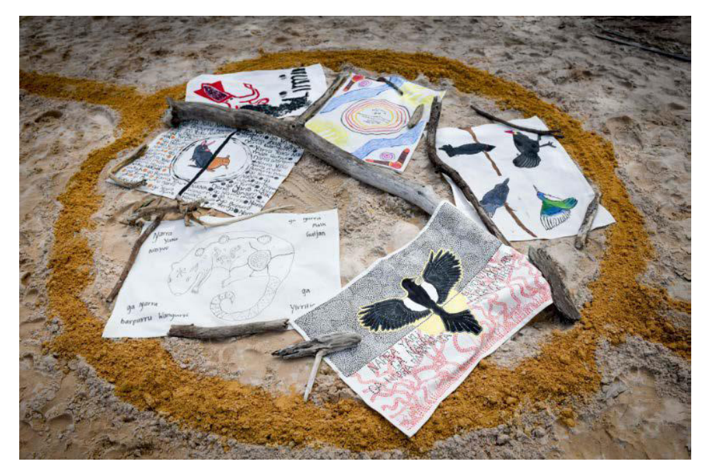
Gurayndja artworks on display.

Unsuccessful applicants will be offered a feedback session if required.